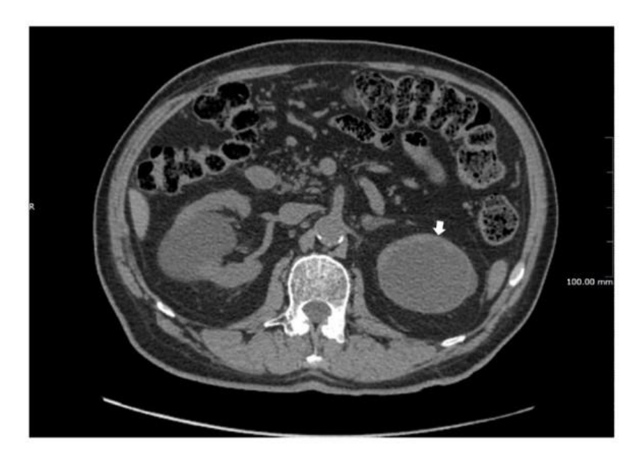
Figure 1. CT shows a round formation located at the left kidney.

At the semiannual checkup, the nephrologist examination showed a slight rise in creatinine and a slight increase in the diameter of the cyst located at the lower pole of the right kidney. Therefore, after six months, it was decided to perform a CT scan without contrast medium again, which showed a slight increase in the size of the round formation located at the left kidney, which reached the size of 74\times56\times57 mm (Figure 1).