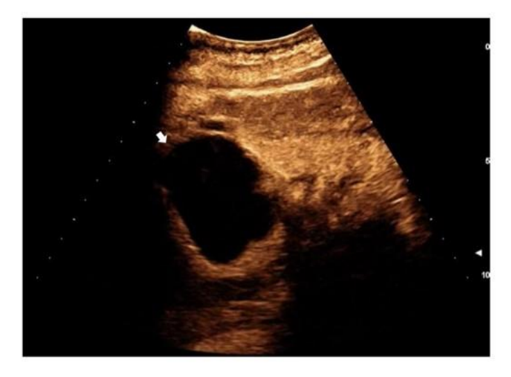
Figure 3. CEUS shows the left renal formation previously seen on CT, after injection of contrast medium.

Here, sharp, well-defined margins and diffuse intraluminal corpuscular/pseudo-solid echogenic material, with contextual more frankly fluid anechogenic microareas, lacking vascularization with color Doppler and Power Doppler, were showed. Bilaterally, flowmetric sampling at the level of intracortical branches of the renal arteries showed flow tracings with an irregular profile, with Resistance Indices between 0.7 and 0.8, compatible with a chronic renal failure. After injection of contrast medium, there was no contrastographic impregnation of the formation at the upper pole of the left kidney. No lesions with solid type contrastographic impregnation were revealed in the cystic lumen. At the upper pole of the left kidney, CEUS concluded for complex cystic formation with presence of intraluminal solid-corpuscular material, with thrombotic-hemorrhagic etiology, in progressive phase of organization, classifiable as Bosniak type II cyst (Figure 3).