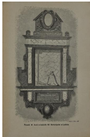
Figure 2 - Wojciech Oczko's (Ocellus) monument in Bernardine church in Lublin, Poland.

Ocellus' two most famous publications are titled Thermal Springs and Przymiot . The latter one is a compendium of knowledge concerning the essence, diagnosis and treatment of the common illness of his time – syphilis. Undoubtedly, its scientific quality puts it on par with similar publications from Italy and France on the disease, which makes Ocellus a renowned, European-scale syphidologist. Some older-day historiographers and historians ascribe other works to Ocellus, which are, however, unknown. The information about them is included in the second, combined, edition of both works.