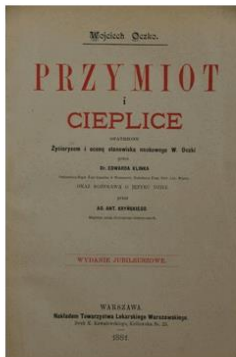
Figure 5 - The title page of republished works by Ocellus Thermal Springs and Przymiot

The work was republished in Warsaw in 1881 by the Warsaw Doctors' Society to commemorate 300 th anniversary of the original publication. The reprint coincided with the 50 th anniversary of medical practice of Józef Majer, the professor of the extension of the Jagiellonian University in Krakow, the honorary member of the Warsaw Doctors' Society and the President of the Academy of Skills in Krakow (Figure 5).