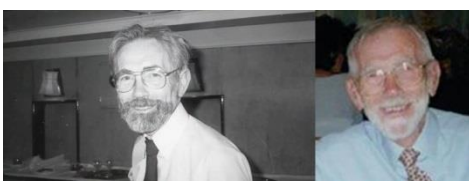
Figure 2 - Prof. David Kerr (born on December 27 th , 1927; died on April 20 th , 2014)